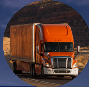
Transportation / Fleet