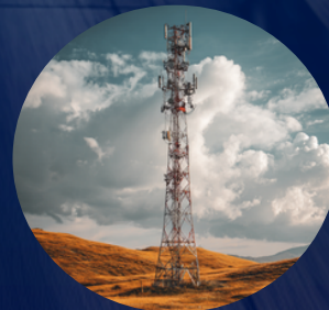
Primary & Failover Network